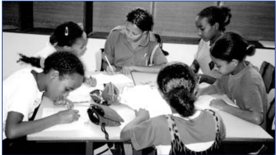
Ethiopian children enjoying school supplies collected by wonderful friends of NACOEJ.

If your kids would like to collect school supplies as a mitzvah project, first, please contact