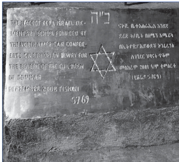
We hope that one day all our Beta Israel children will be in Israel, and our school will be a treasure for the neighborhood children. But we don’t want to be forgotten. So we have set a simple stone slab in front of the school. It shows a Star of David and the Hebrew letters that mean Baruch Hashem. Below, in English and Amharic, it identifies the school: “The NACOEJ Beta Israel Elementary School founded by the North American Conference on Ethiopian Jewry for the benefit of the children of Gondar. September 2008/Tishrei 5769.” We hope it will always remind people of the Jews of Ethiopia and America who came here together, to teach and learn in Gondar.

And we must be doing a pretty good job, because on October 2, 2010, our NACOEJ Beta Israel