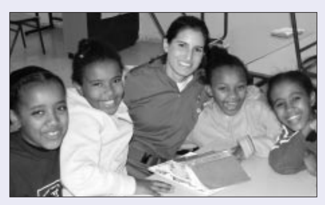
NACOEJ After-School class.

Adults played checkers using bottle caps for pieces. The libraries created in our compounds gave children the only books they ever had.