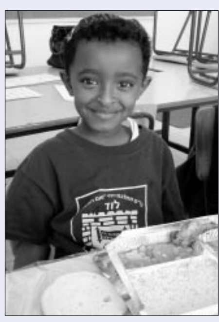
NACOEJ After-School lunch.

In Ethiopia, there were no toys (except in our compound pre-schools). At most, a child in a village might have a doll made of a stick with a scrap of cloth wrapped around it, or a little clay animal made by his or her mother.