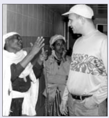
Joyful meeting in an absorption center.

But what I want to tell you about now is what I discovered a few weeks ago when I visited old friends from Ethiopia in absorption centers and schools and homes in Israel.