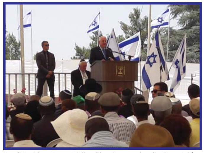
Israel President Reuven Rivlin addressing crowd at the Memorial for those who died in Sudan as they made aliyah from Ethiopia to Israel.