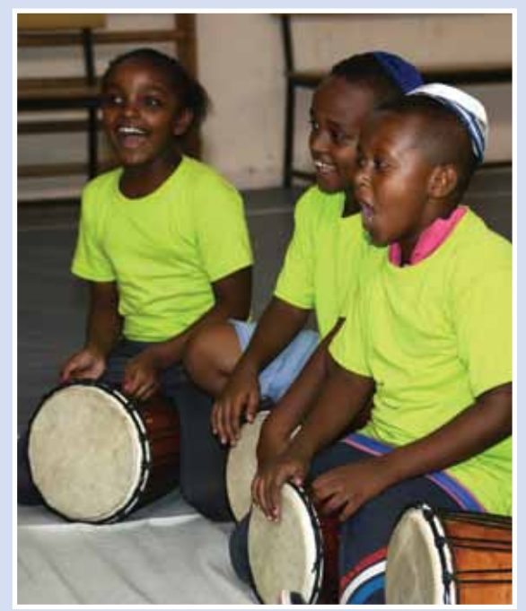
In Lod, children used drums and good loud singing voices to release tension and fears.

This year, with rockets raining down and sirens screaming at all hours, with families scrambling for safety with only seconds between warnings and attacks, we were determined to bring some respite, some fun,