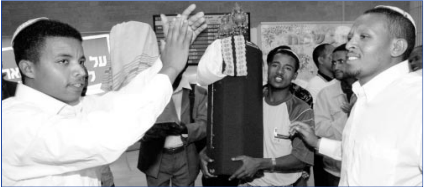
Arriving at Ben Gurion airport, the Sefer Torahs are greeted by Ethiopian-Israeli leaders, Jewish Agency staff and Israeli rabbis.