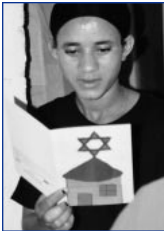
In the Kiryat Yam bomb shelter, a new immigrant reads the messages in a NACOEJ Rosh Hashanah card.