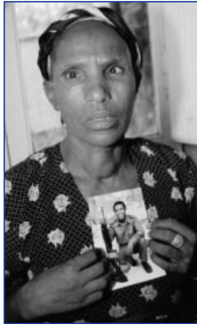
In a broken family in Ethiopia, the most precious possessions are the photos of children, parents and siblings in Israel. Here a mother in Ethiopia holds a photo of her son in the Israeli Defense Forces.

In the meantime, we at NACOEJ struggle to keep hope alive by providing the funds that enable the Beta Israel to run programs that feed and teach and support the community. We have learned that in this time of terrible uncertainty, we must plan as if we will be the channel