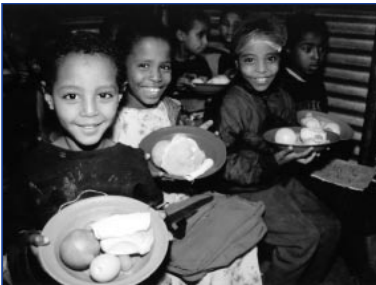
Lunchtime! For Jewish children in Ethiopia, school lunch ends half a day of hunger. Will there be an evening meal? Maybe – maybe not.