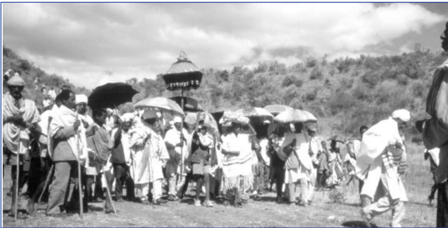
In Ethiopia, years ago, Kessim (Jewish religious leaders) lead a procession toward a mountain where Sigd will be held. Elaborate ritual symbolizes the religious authority of the Kessim. White garments and shawls symbolize purity.